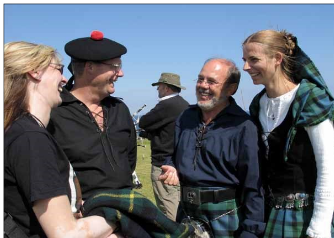
Visiting 2008 Durness Games